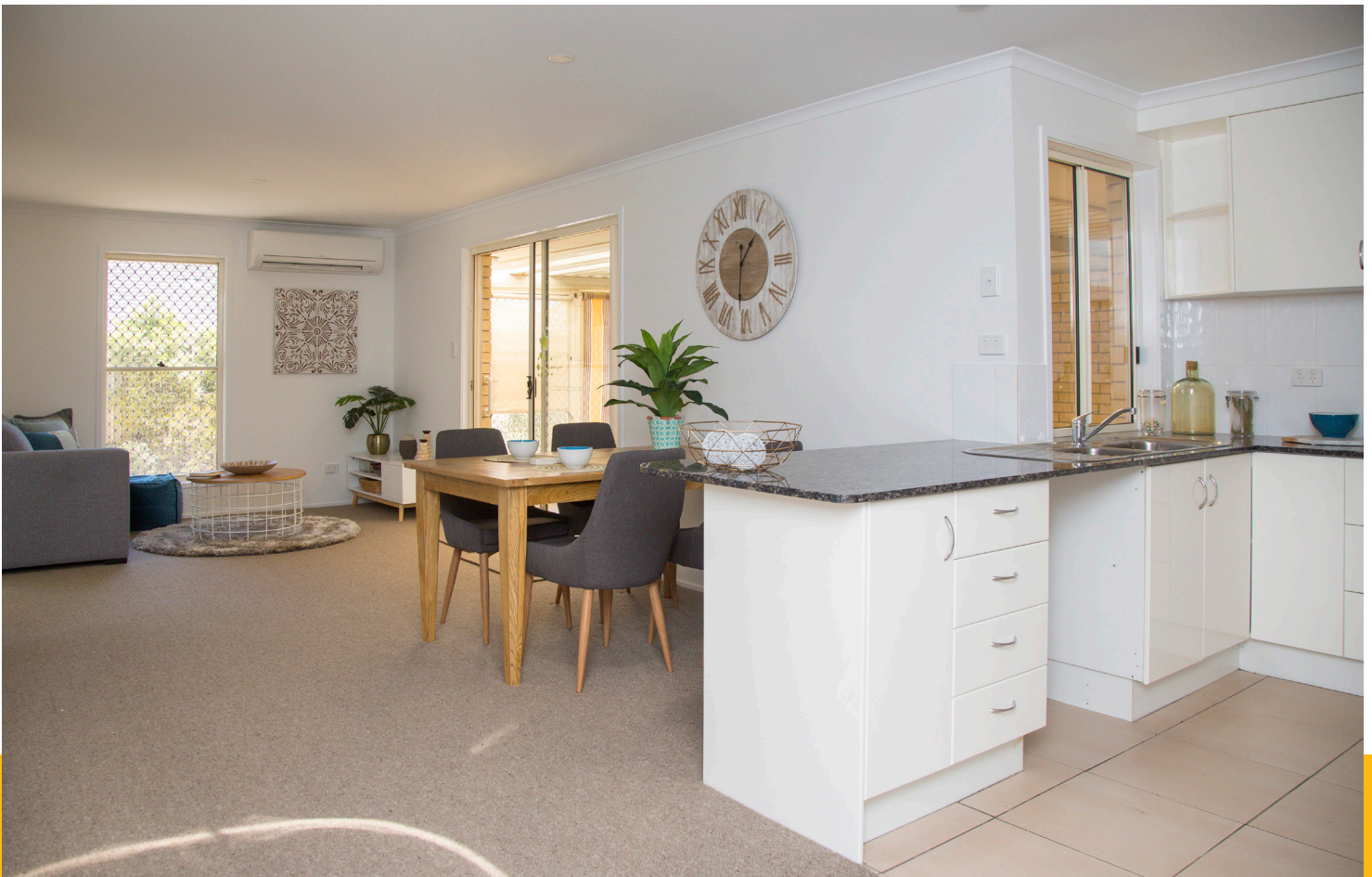
Top left - Choose from 139 one to three-bedroom apartments with private terraces, parking and on-site security.