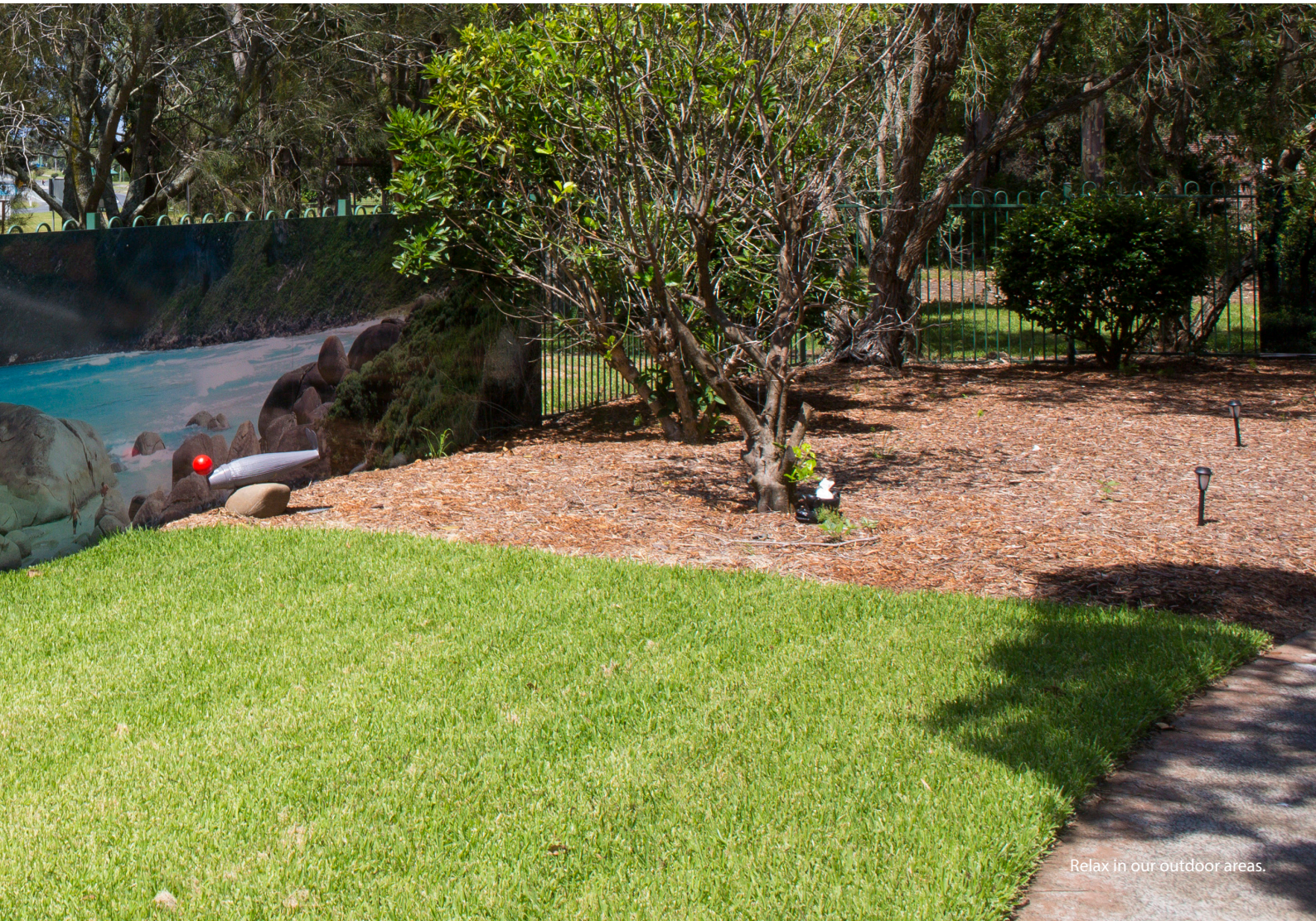
Relax in our outdoor areas.