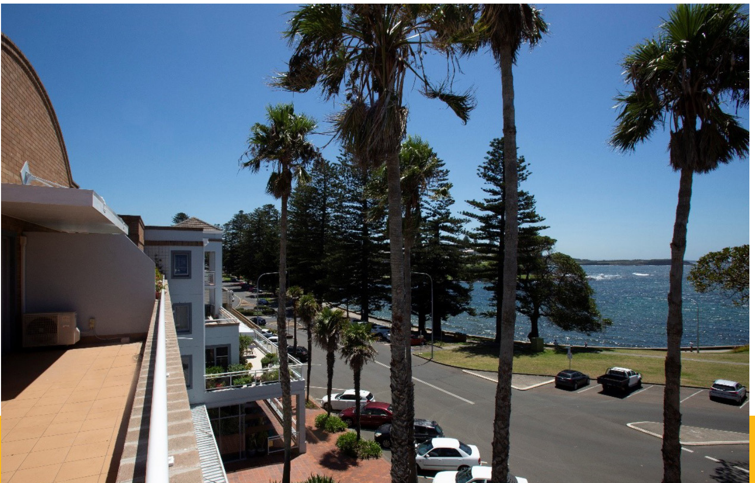
Top left - IRT Harbourside has been created to enhance the natural light filtering through from the glass roof.