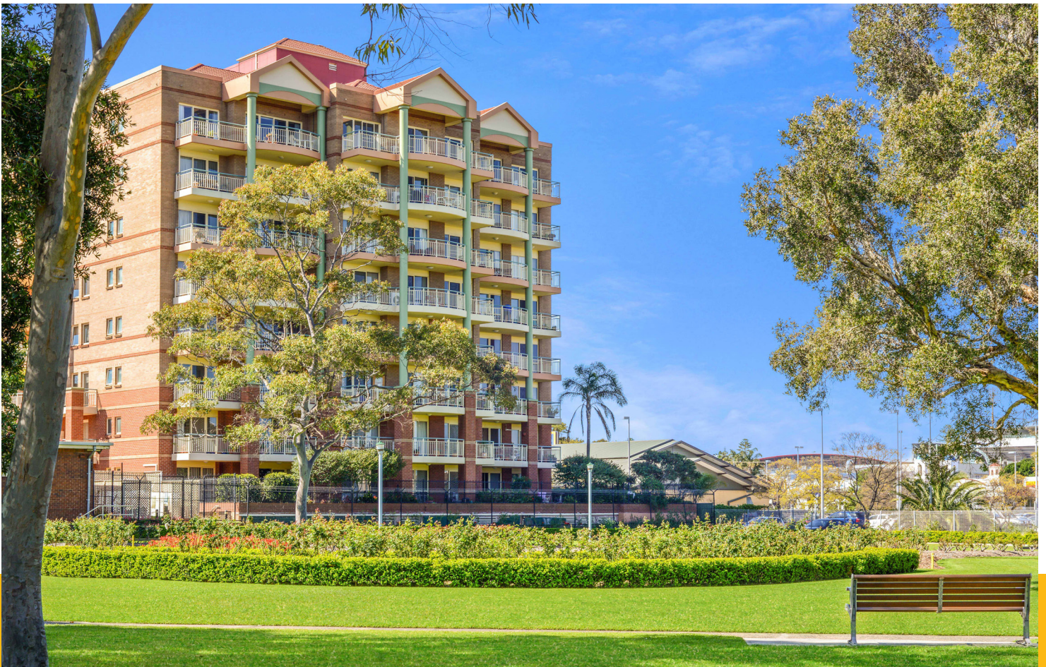
Top left - Enjoy our beautiful landscaped gardens.