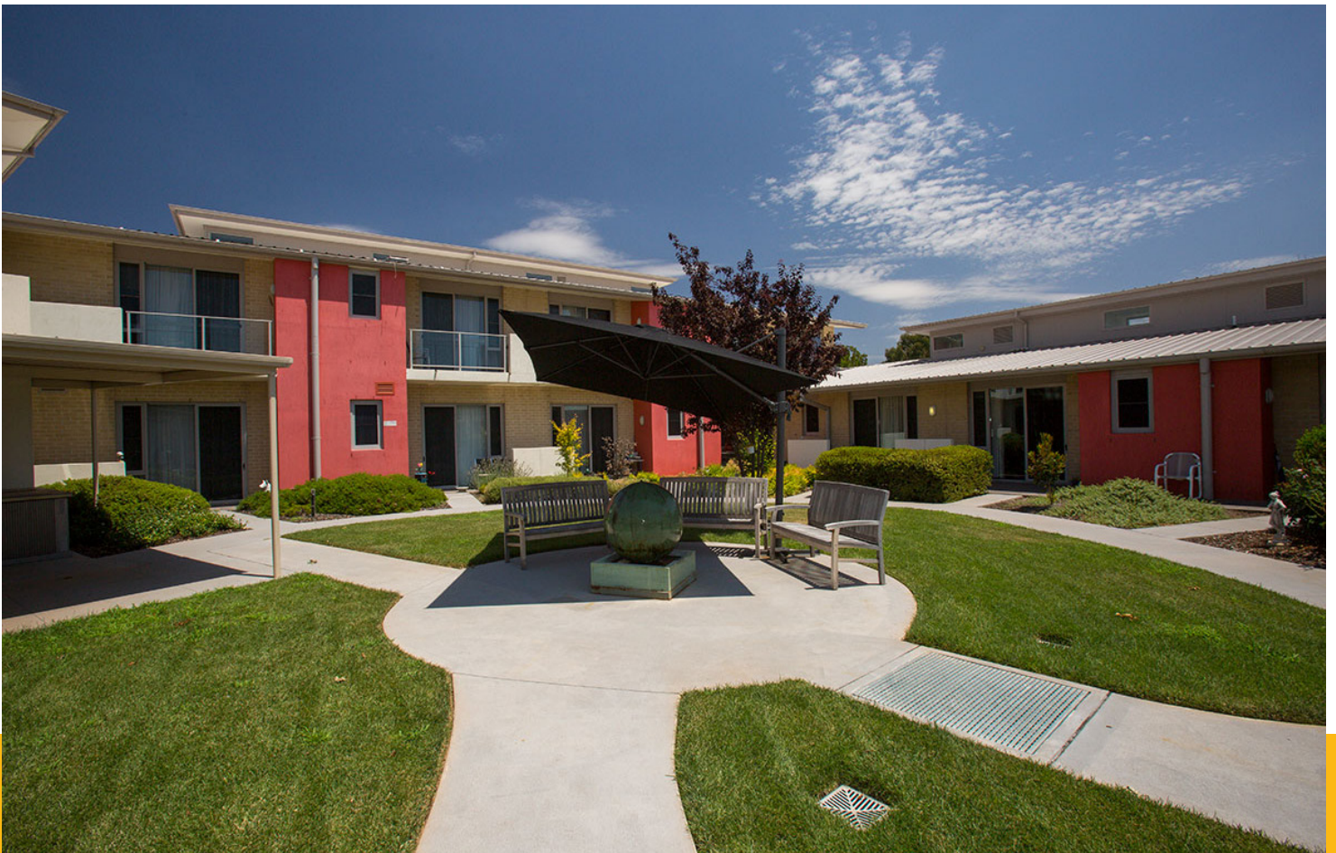
Top left - Receive professional care with a personal touch.