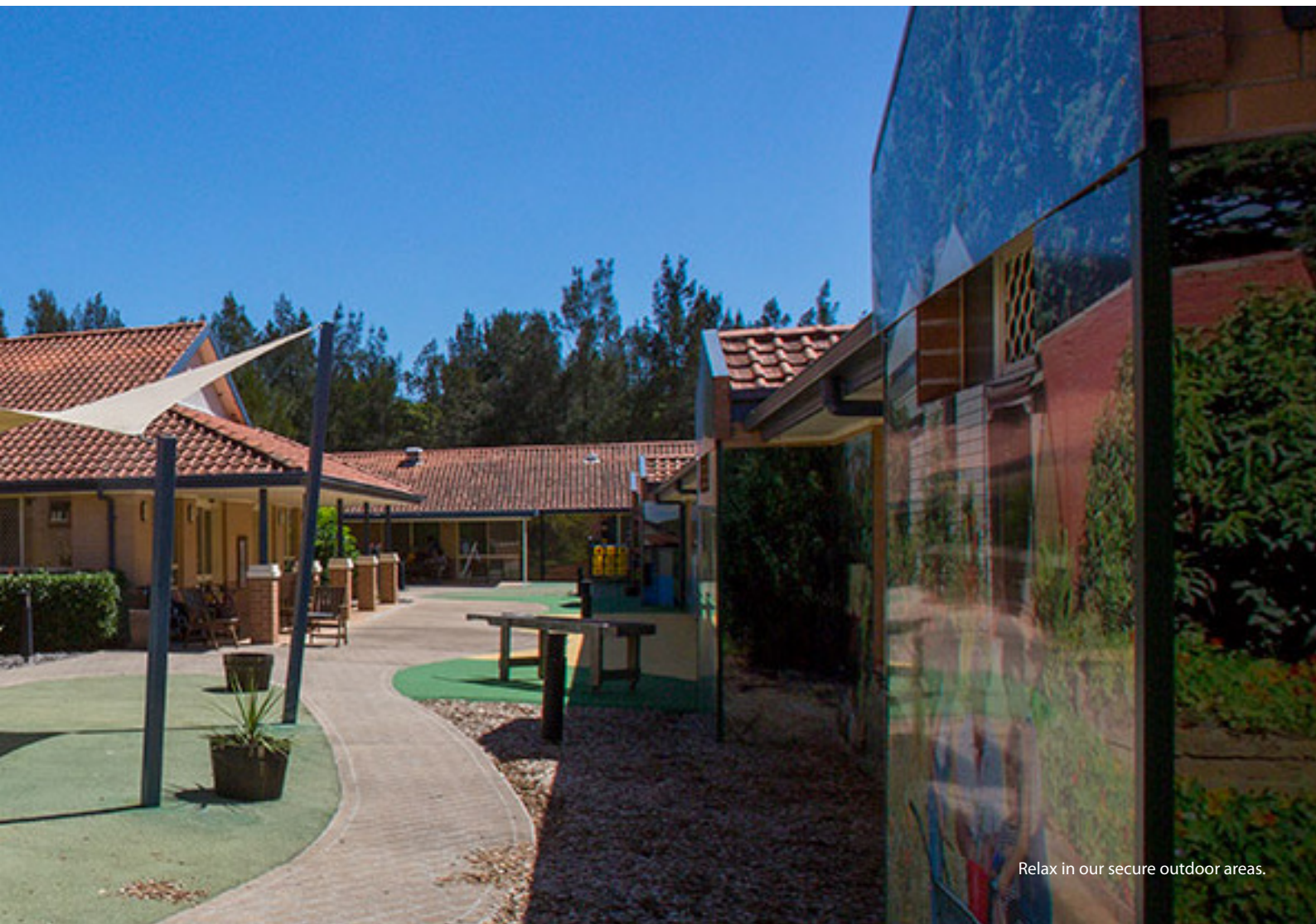
Relax in our secure outdoor areas.