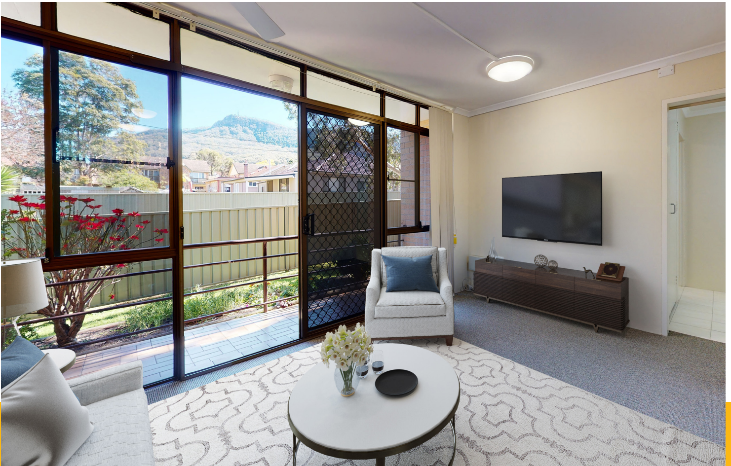
Top left - Choose from 30 one and two-bedroom apartments with private balconies, parking and on-site security.