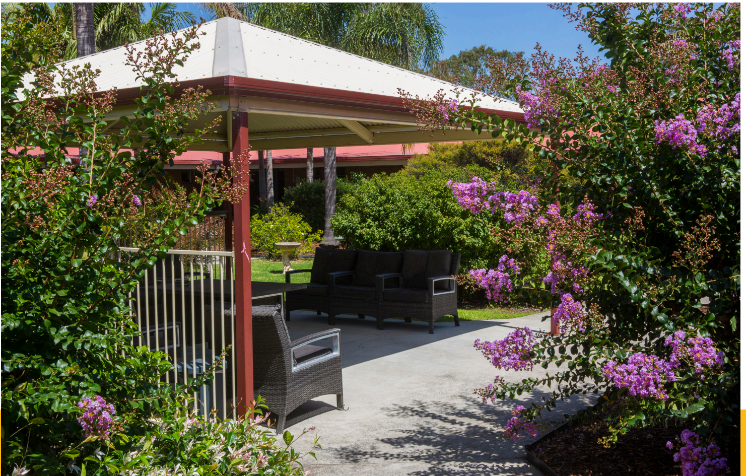
Top left - Rest easy in your new home.