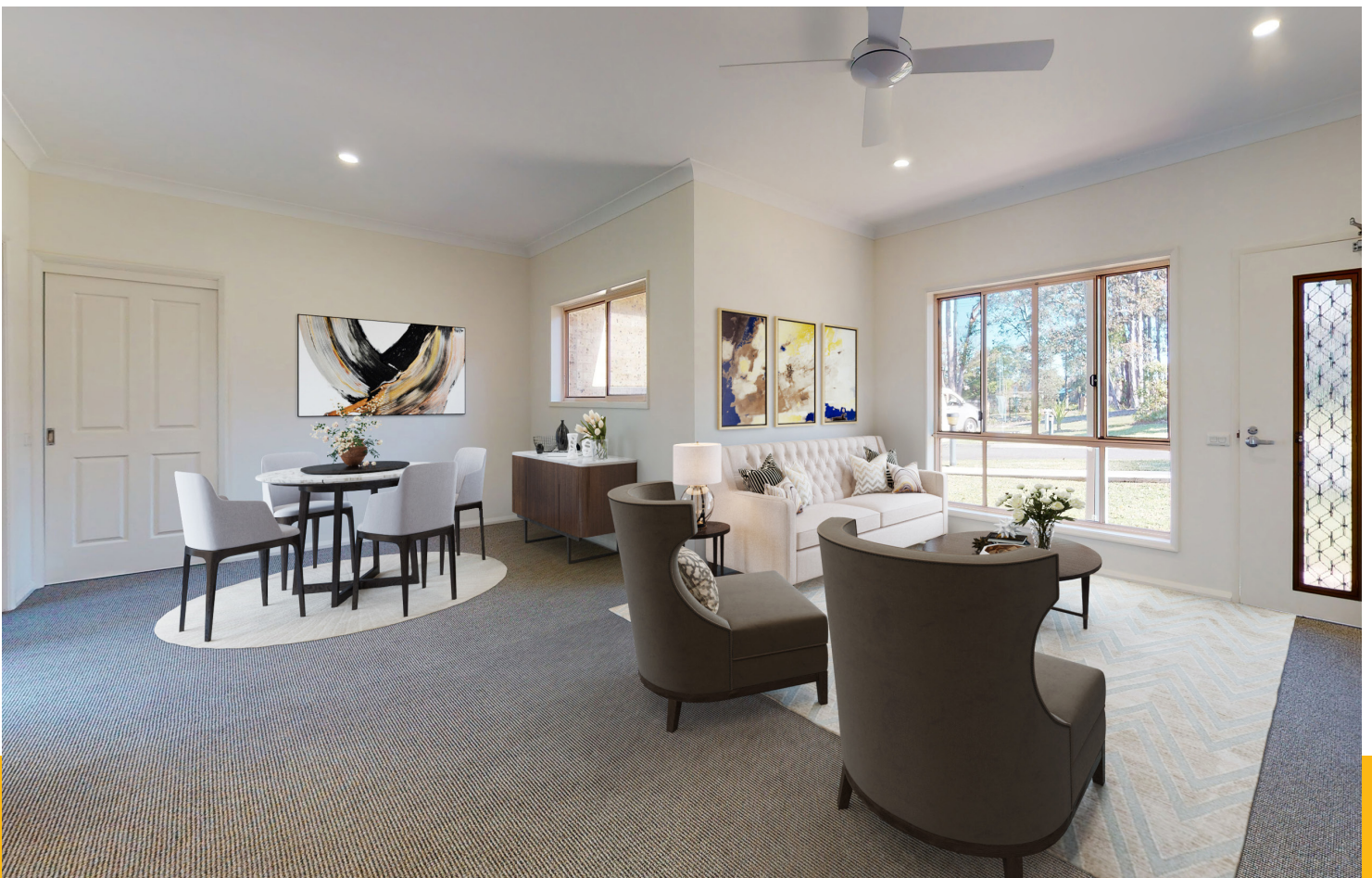
Top left - Nestled in a spacious bushland setting, this community is designed to maximise the beautiful natural setting.