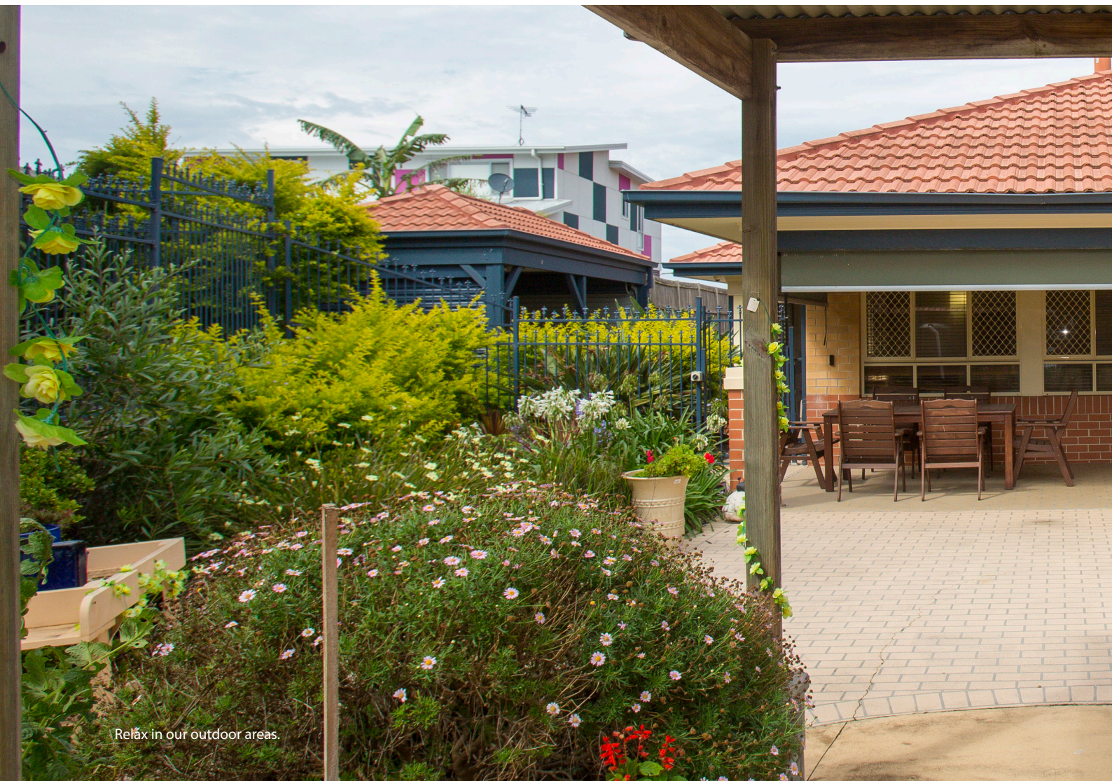
Relax in our outdoor areas.

Our boutique aged care centre offers professional personalised care in modern surroundings. Choose from a range of ensuite studios complete with kitchenettes, or experience specialised dementia care in a secure environment. A Registered Nurse is available on site to ensure you're well cared for.