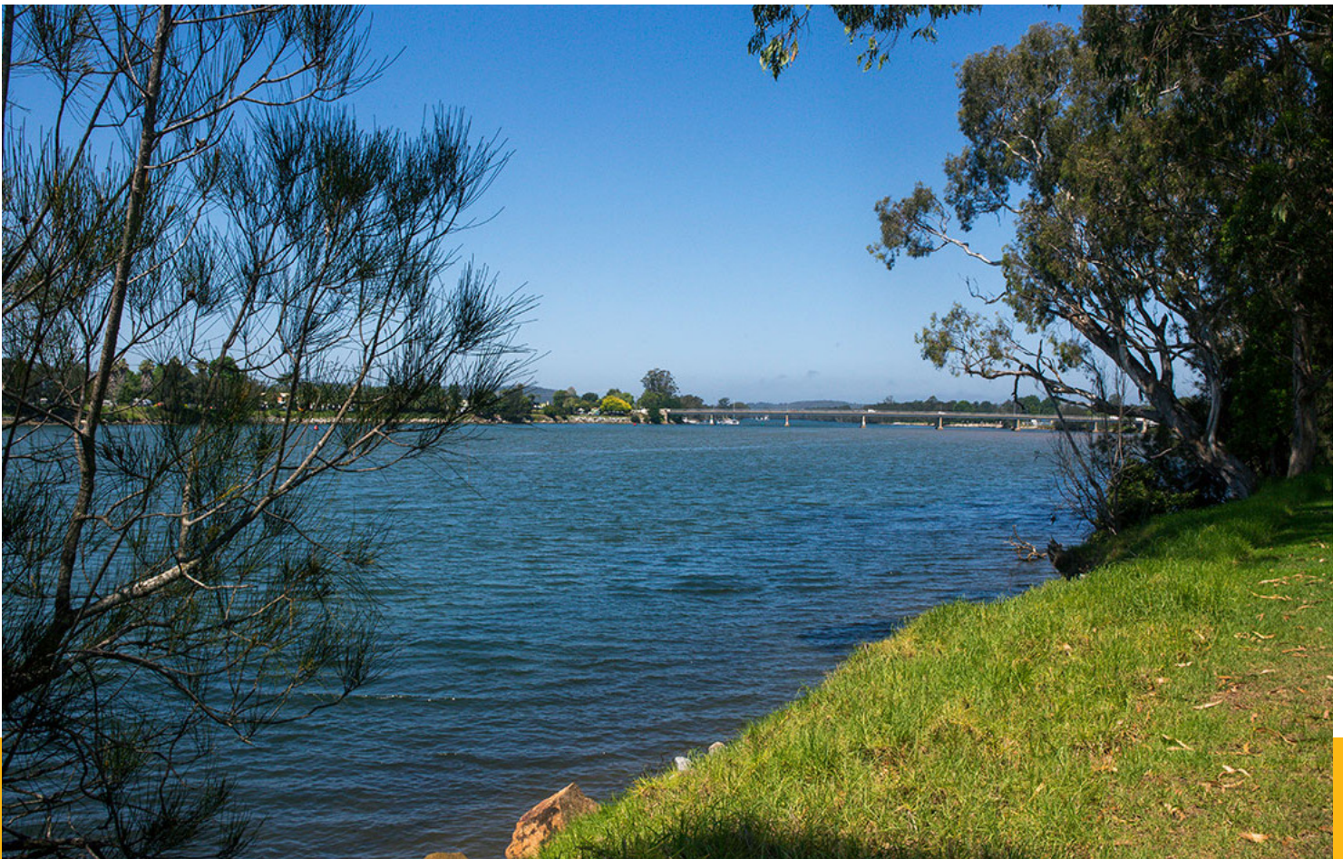
Top left - Be surrounded by stunning landscaped gardens.