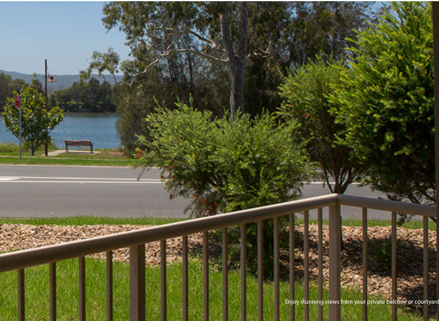
Enjoy stunning views from your private balcony or courtyard.