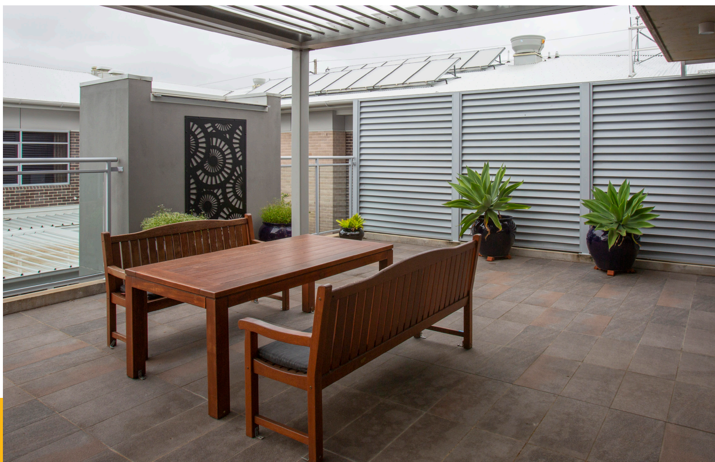
Top left - Receive professional care with a personal touch at IRT Tarrawanna.