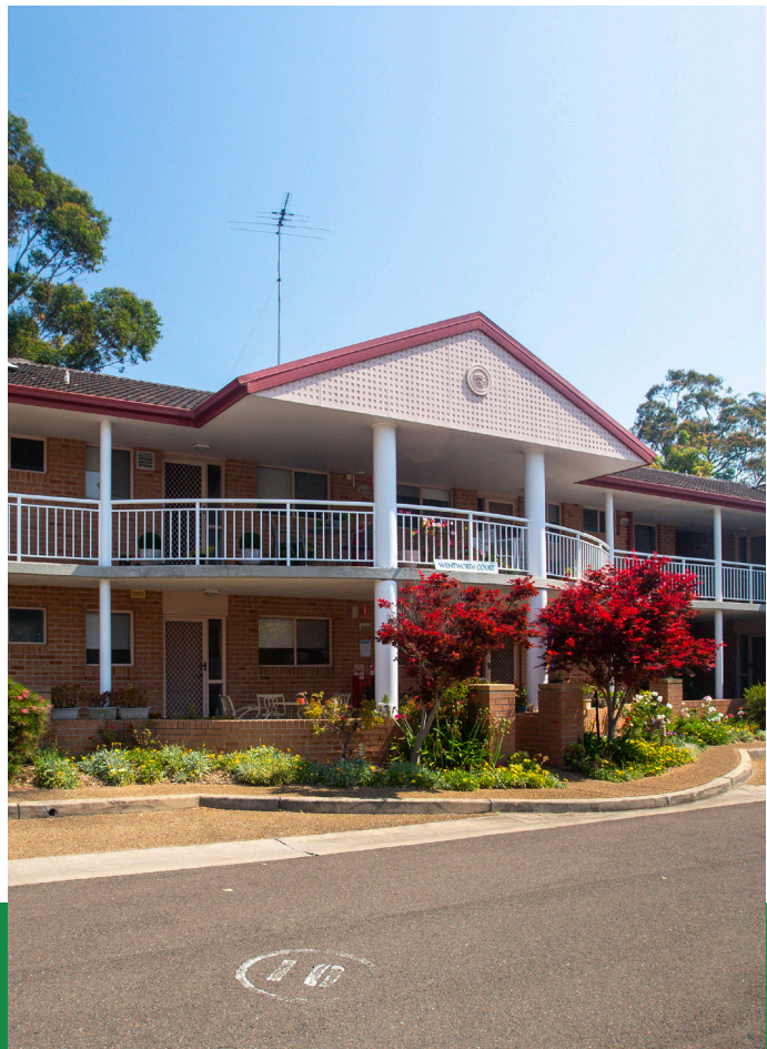
Top left - Flametree Aged Care Centre.