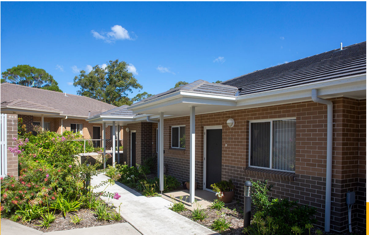
Top left - Receive professional care with a personal touch.