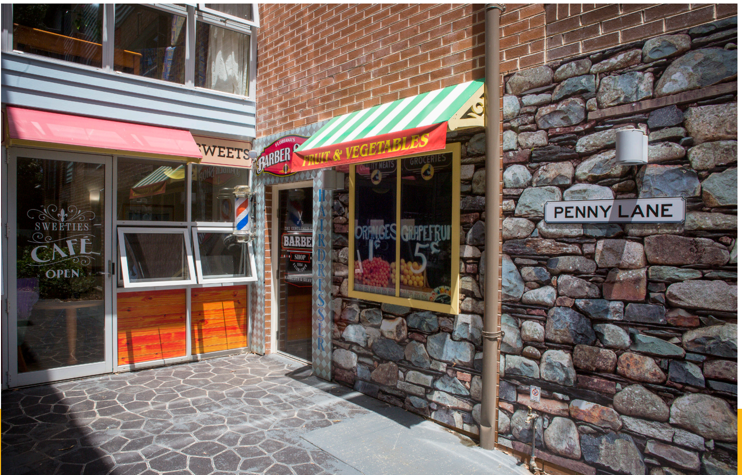
Top left - Receive professional care with a personal touch.